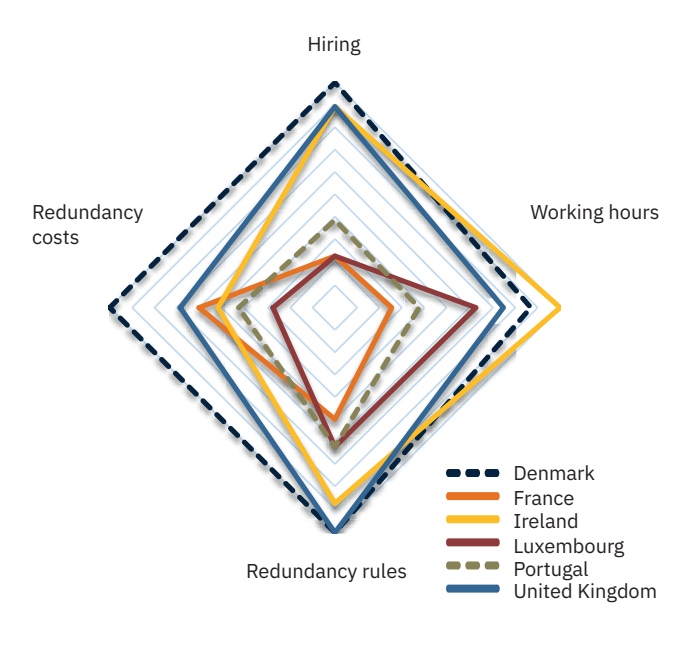
Figure 3. EU countries with the most and the least flexible labour regulation